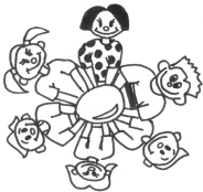
Working Together Relay

OPENING: Play the relay game "Working Together."